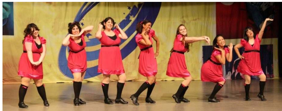
The “adults” at competition, dancing to “We’re Not Gonna Take It!”